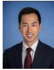
Dr. Jong Wook Lee