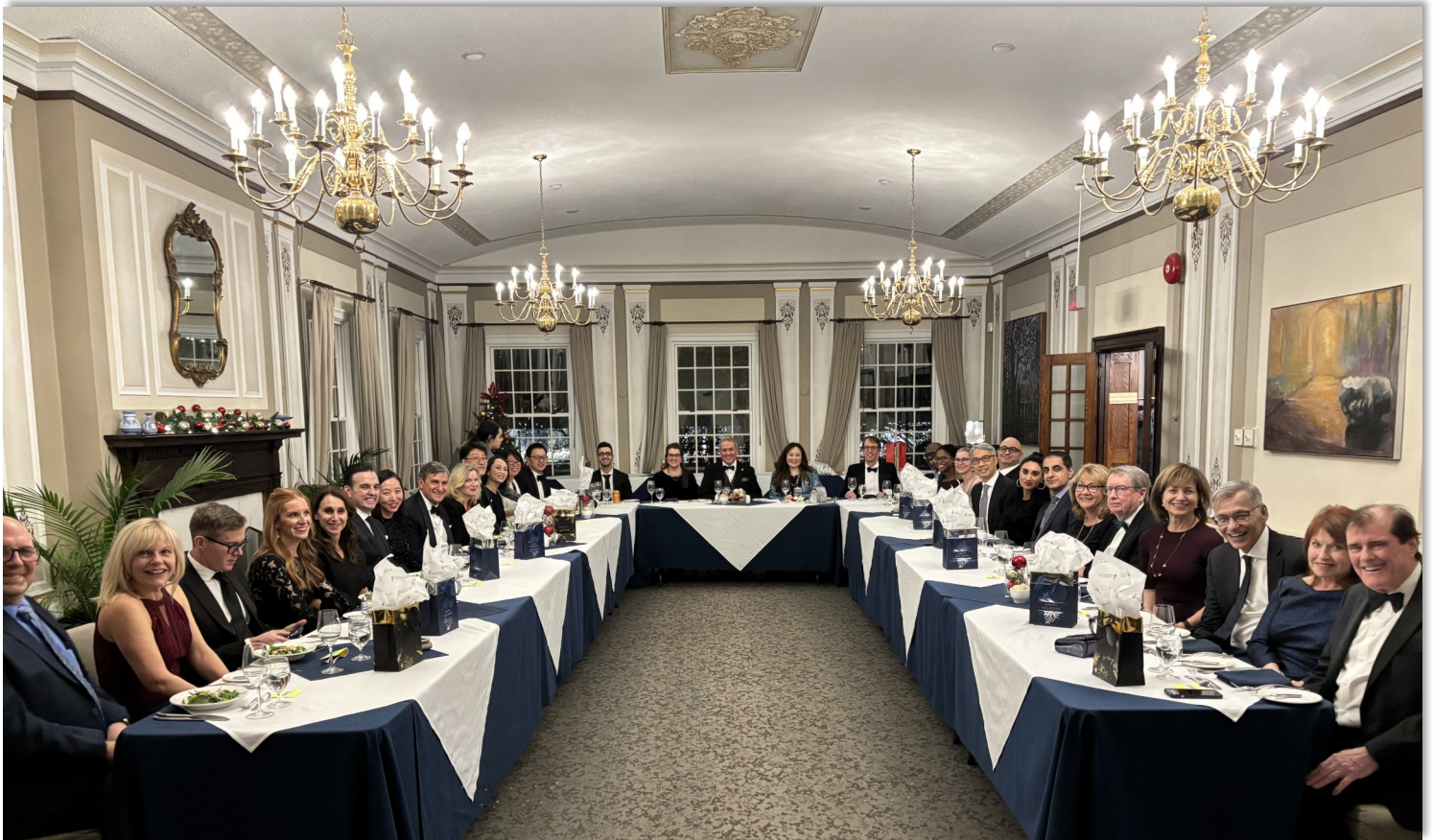
2023-24 Departmental Executive Committee and their guests – Holiday Dinner held on December 5, 2023 (Faculty Club)