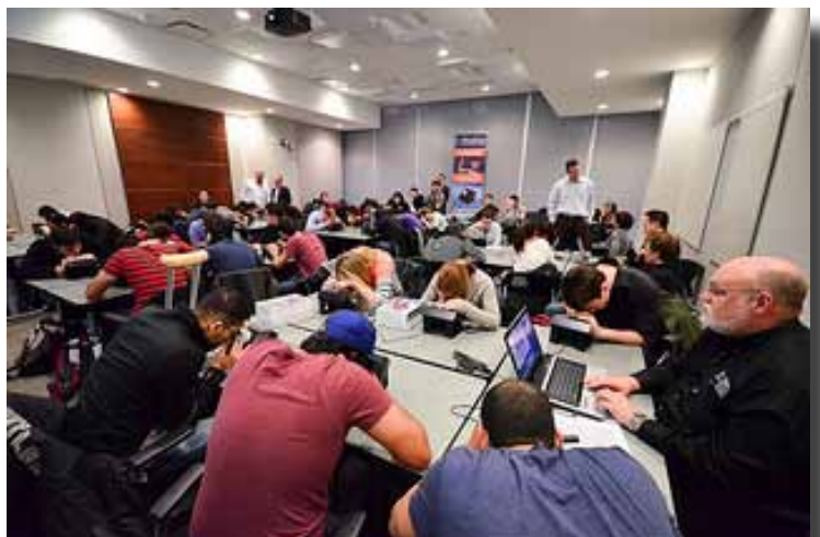
February 13, 2013 OtoSim™ Session for MMMD students

http://youtu.be/Wz6Jp-HMS_0 (1min 26secs)